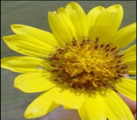
Arrowleaf Balsam- root ( Balsamorhiza sagittata (Pursh) Nutt)