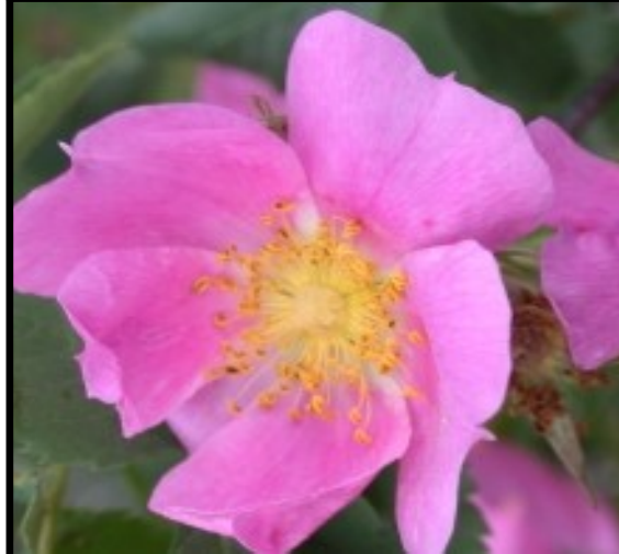
Wood's Rose ( Rosa woodsii Lindl.)