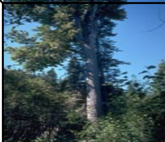
Black Cottonwood ( Populus balsamifera trichocarpa - Torr. - Gray Ex hook