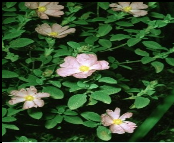
Oregon Bitterroot or Rock Rose ( Cistus Incanus L.)