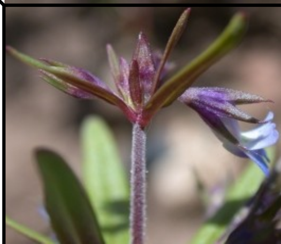
Maiden Blue Eyed Mary ( Collinsia parviflora Lindl.)