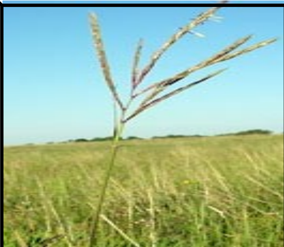
Big Bluestem ( Andropogon gerardii Vitman)