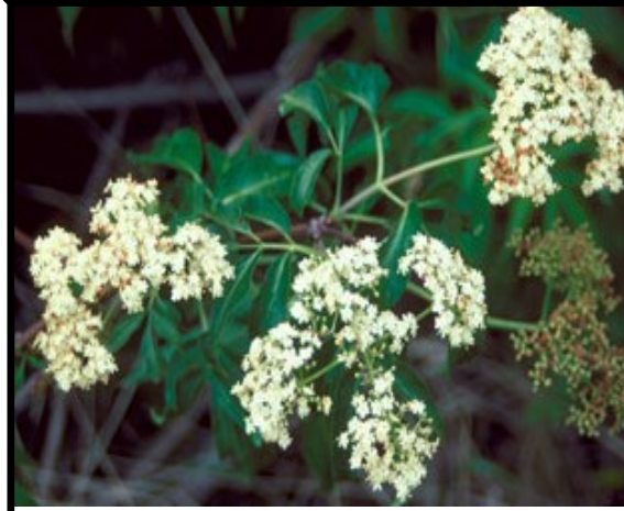
Blue elderberry ( Sambucus nigra ce- rulea L. (Raf.) R. Bolli)