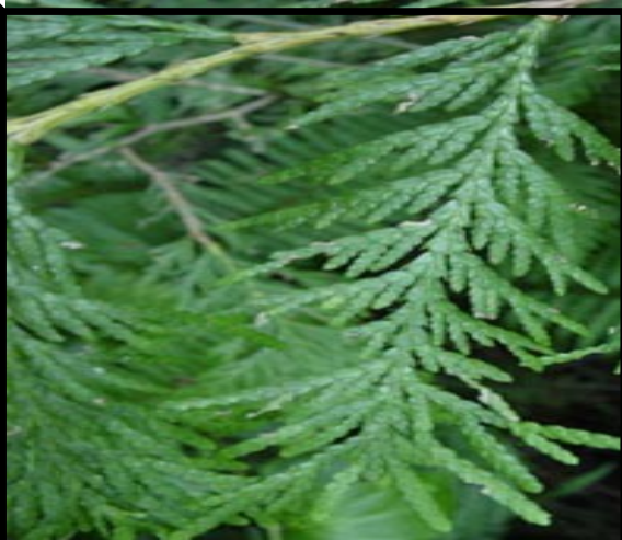
Western Red Cedar ( Thuja plicata Donn ex D. Don)