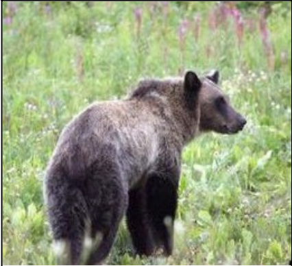
Grizzly Bear ( Ursus arctos Linnaeus )