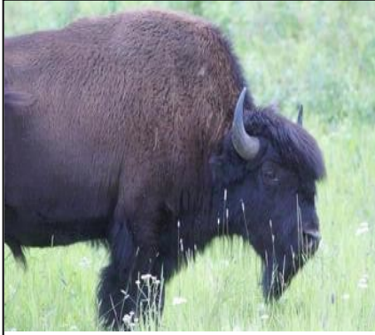
American Bison ( Bos bison Linnaeus )