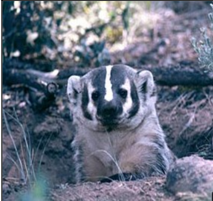
Western (American ) Badger ( Taxidea taxus )