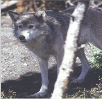
Gray Wolf ( Canus lupus Linnaeus )