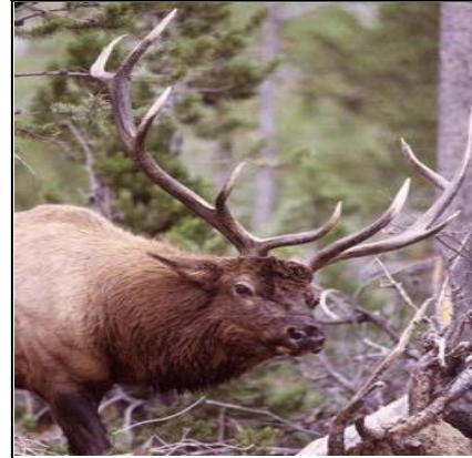
Elk ( Cervus elaphus Linnaeus )