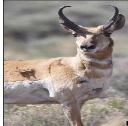
Pronghorn Antelope ( Antilocapra americana )