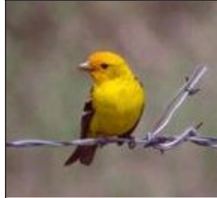
Western Tanager ( Piranga ludoviciana )