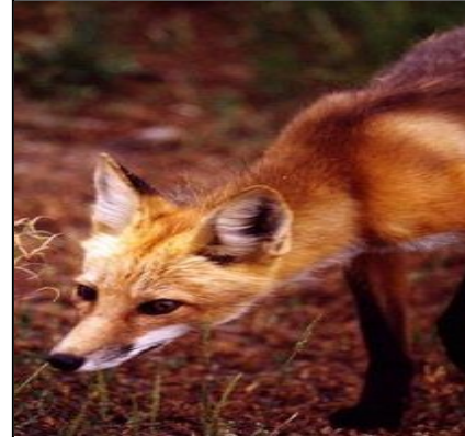
Red Fox ( Vulpus vulpus Linnaeus )