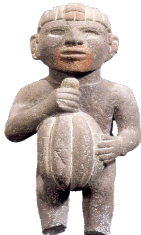
{god holding a cacao bean}

The Maya farmed cacao trees just so the kings could have their favorite frothy chocolate drinks whenever they wanted.