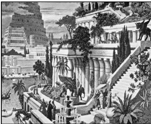
Hanging Gardens of Babylon