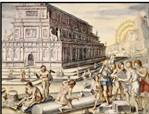
Temple of Artemis at Ephesus