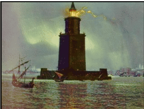
Lighthouse of Alexandria

Cut this title out and glue on page over the 7 wonders.