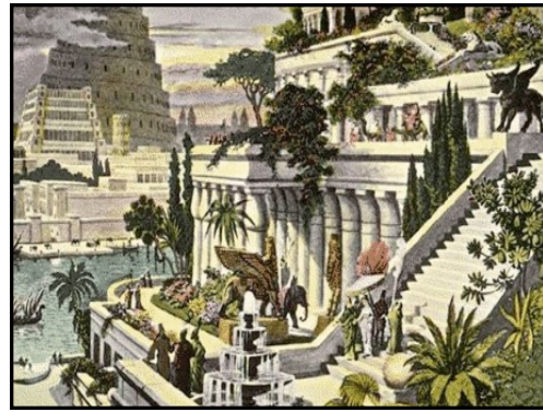
Hanging Gardens of Babylon