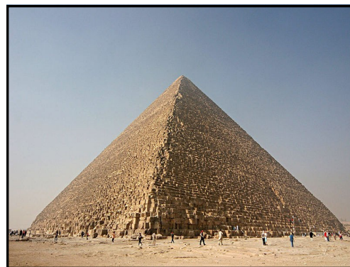
Pyramids at Giza