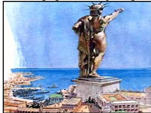
Colossus of Rhodes

Cut out minibook. Solve using the clues. Glue the cover on the outside. On the inside left of the book write the name of the wonder.