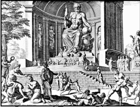
Statue of Zeus at Olympia