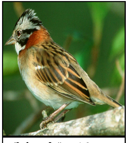
Rufous Collared Sparrow